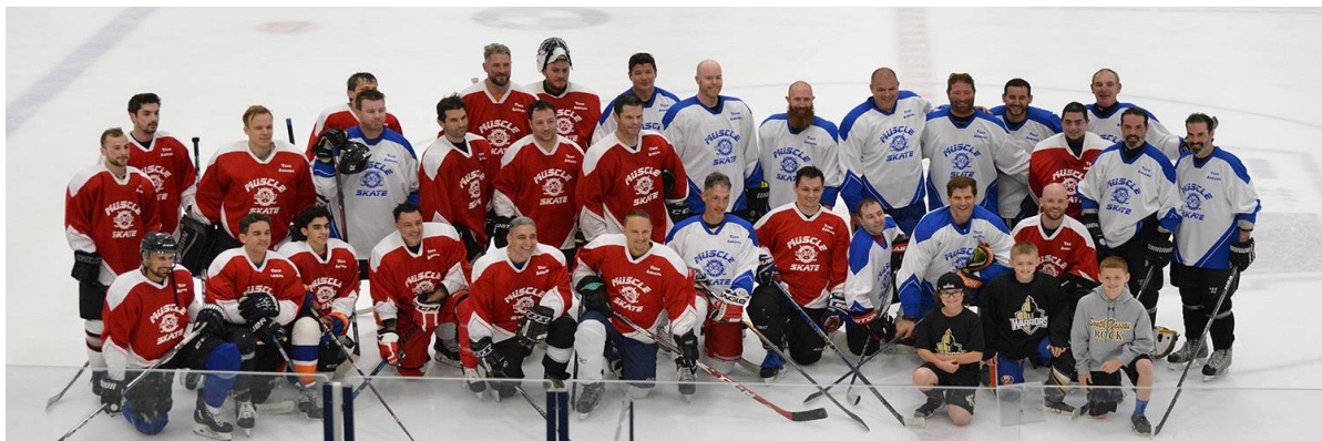
Muscle Skate 2018

Can't attend? Want to help? Learn more about FA & donate by going to: FARA (Friedreich's Ataxia Research Alliance) at www.cureFA.org/caprimuscleskate